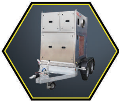
Emergency & Standby

Whatever type of oil, gas or petrochemical facility or application, Magnus Energy Services can develop a solution to your temporary or long-term hazardous area climate control requirements. Magnus Energy Services helps our customers increase profits by creating opportunities, solving problems and reducing risk using our unique equipment and technical services.