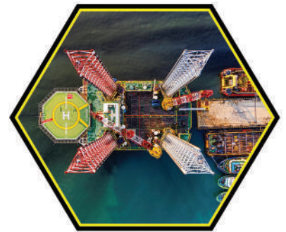
Support Existing Assets