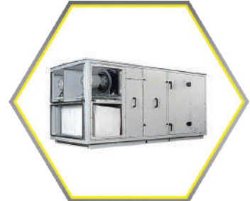
Single Frame Redundant System (Horizontal)