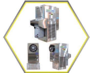
Air Conditioner (+Ventilation AC)