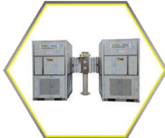
Two Frame Redundant System