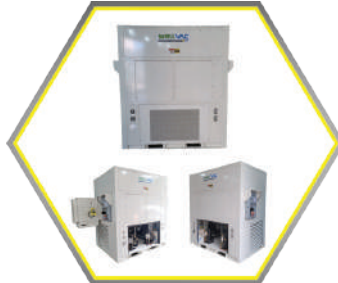
Single Frame Redundant System (Vertical)