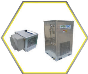
Chiller Unit (for Gas/Liquid)