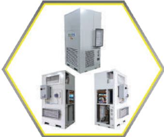
Single HVAC System (Fan redundancy)