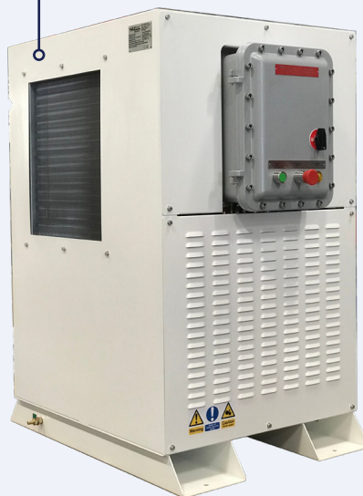
BHZ1 ATEX Water Chillers