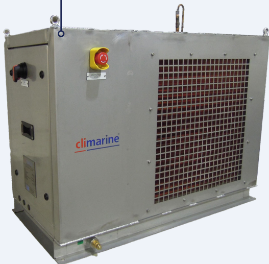
CM5 Split Air Conditioner